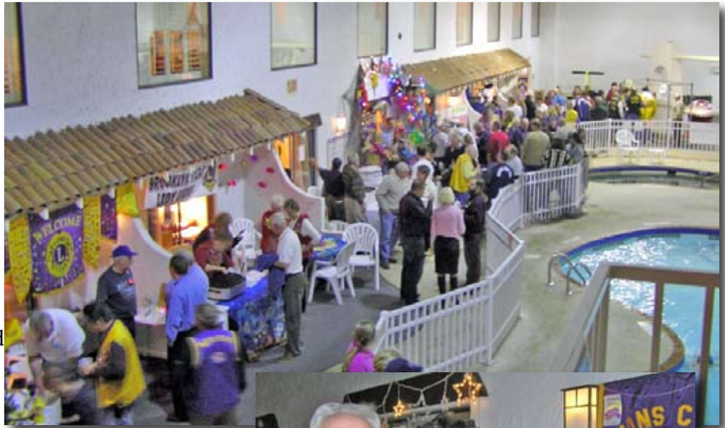
Lion members enjoyed visiting the poolside hospitality rooms at the Mid-winter Convention.

The Eden Prairie Lions Club participated in the Sunday morning Parade of Checks with a total of $6,000. Donations went to: Diabetes Foundation, $1,000; Lions Eye Bank, $1,000; Macular Degeneration Research, $1,000; Lions Hearing Foundation, $1,000; Lions Club International, $1,000; Leader Dog, $500; Service Dog, $500.